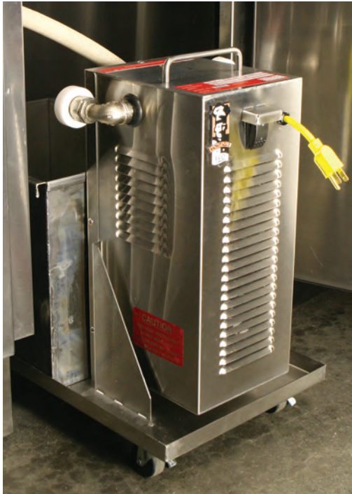
Model RD18 with filter